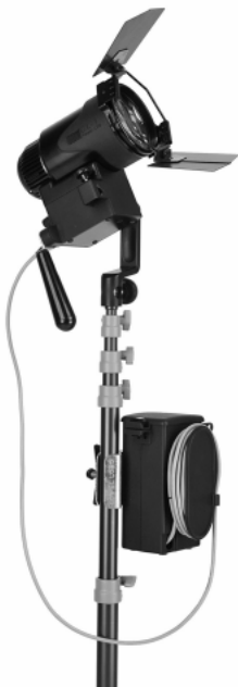
The PRO Power LED Battery System is a product of Lowel-Light, the Academy Award Winning World Leader in Location Lighting.

The Lowel PRO Power LED Accessory Battery System is a professional product. Please read these, and PRO LED instructions fully before operating.